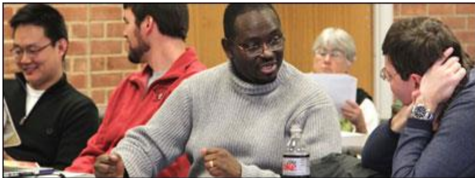
The image and portions of this article have been reprinted from The Lewis Center for Church Leadership's eNewsletter from July 1, 2015 entitled "Leadership Lived: Clementa Pinckney and Open Doors" and can be found at www.churchleadership.com